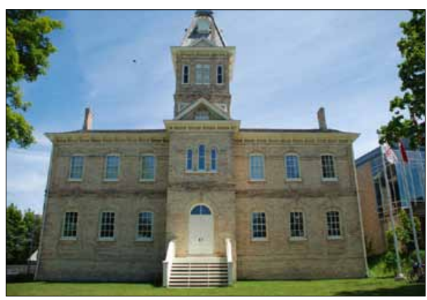
Bruce County Museum, Cultural Centre and Archives

Our Neighbours to the North Saturday May 9, 2020